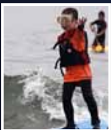
Surf 2 Heal