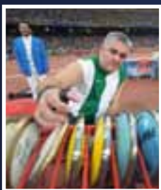
Paralympic Athlete Search Day