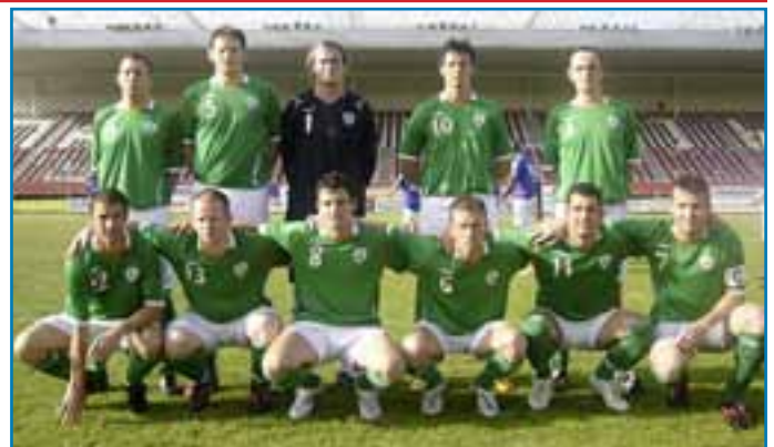
Deaflympics Website: www.2009deaflympics.org

IDSA is sending a panel of Athletic, Badminton, Men Football, Swimming, Water Polo teams with total of 42 athletes.